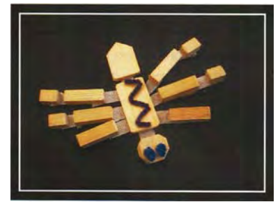
Make a Minibeast kit